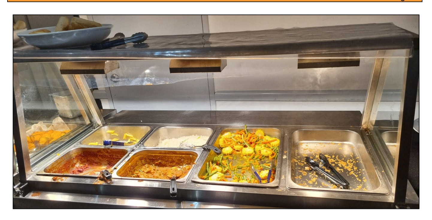
All that was left in the bain-marie after the troops had had their fill.